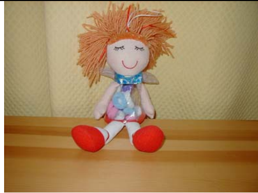
the body is clear plastic but containing decorations for the doll's hair