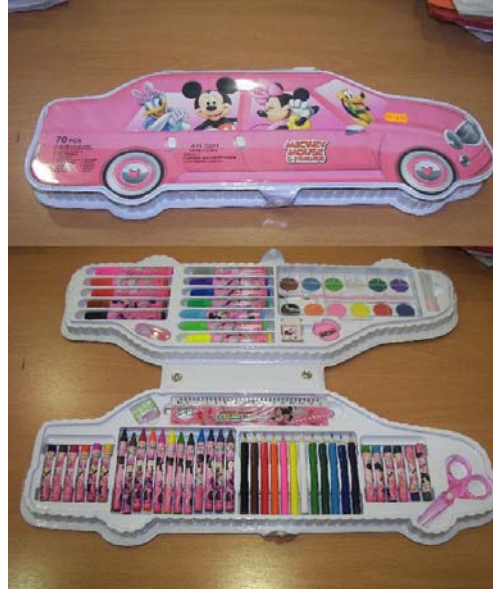
the toys can be played with in his exact form and so the packaging become an integral part of the toy