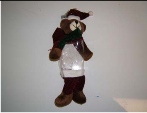
the centre section is clear plastic and the toy can be filled with confectionery or chocolates